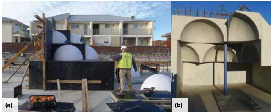
Fig. 3: A mockup was used to verify methods and materials for construction of the muqarnas: (a) formwork with molded and coated fiberglass domes; and (b) finished surface after stripping the molds

To ensure the finish could be achieved, Sydney-based builder Infinity