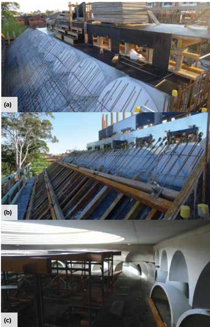
Fig. 4: Muqarnas were formed using molded fiberglass minidomes spaced 120 mm (5 in.) apart, and the flat surfaces between minidomes were formed using galvanized steel on plywood panels: (a) view of minidome forms installed on scaffolding; (b) view of exterior formwork for the sloping roof; and (c) view of minidomes during stripping operations

The designer initially envisioned the dome to be constructed in stone. However, after a series of prototypes were considered, a structural steel dome supported by a concrete ring beam was selected. The ceiling of the dome is finished with sheets of marine plywood with hoop pine veneer (Fig. 5). The stepped concentric circles of the ceiling and ring beam, along with the diffuse light provided by the dome's