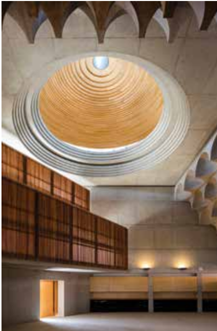
Fig. 2: A view from the floor of the main prayer hall, showing the stepped soffit of the concrete ring beam and rows of quarter-sphere muqarnas. Since this photo was taken, Turkish and Iranian calligraphers have inscribed the smooth and seamless concrete surfaces of the minidomes with the 99 names of Allah in gold calligraphy

concrete was to serve as the painting surface for calligraphers, Candalepas did not want to use any chemical release agents. He also provided no option for patching damaged surfaces.