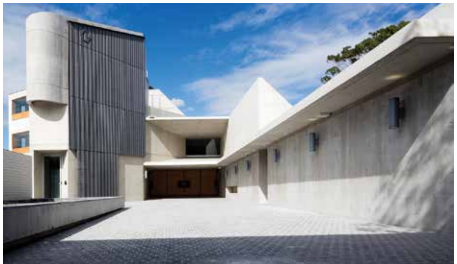
Fig. 1: Punchbowl Mosque, Sydney, Australia, with main entry doors facing the street and a single minaret adjacent to the entry (left)

Architecturally as well as spiritually, the design speaks to the efforts of AIM and Candalepas to improve interfaith relations in New South Wales. The main entry doors intentionally open to the street (Fig. 1), creating a sense of welcoming and transparency to passersby of all faiths. Adjacent to the entry, a single minaret is subtly incorporated into a wing of the building that frames the mosque’s courtyard (Fig. 1).