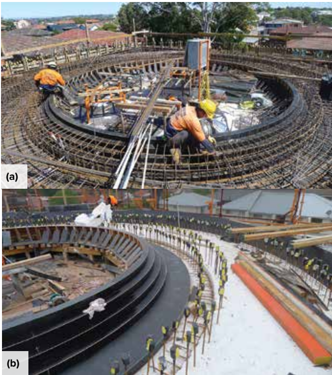
Fig. 6: Ring beam construction: (a) before the first concrete placement; and (b) before the second placement

Selected for reader interest by the editors.